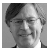
Prof. Paul Cartledge (UK) Vice Chair BCRPM