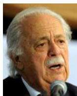
George Bizos SC (RSA) Human Rights Advocate & Author, founder of the South African Committee