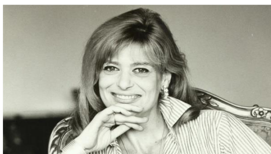
Melina Mercouri in London